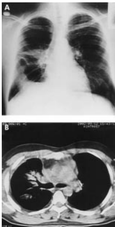
Figure 2 (A) Posteroanterior chest radiograph and (B) CT scan showing marked reduction in the lesions shown in fig 1.

We conclude that, in patients with a large or bilateral pulmonary BALT lymphoma, transbronchial or transthoracic biopsy and mediastinoscopy are useful diagnostic procedures