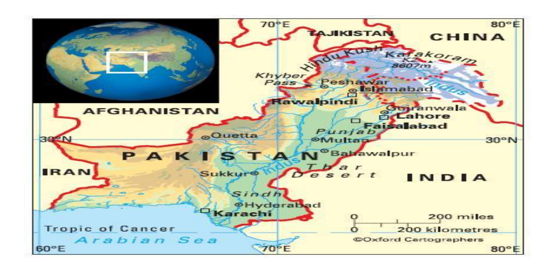
Map-2: The geopolitical Context of Pakistan

Because of its location in the middle of the Spykman Rim, it is in a critical position for the control of the heartland and because of its dominant position in the land and sea routes for the cause of conveyance of Central Asia and Middle East energy possessions Pakistan's geography with its outstanding geopolitical value in the vast area stretching from the northeast to the southwest, it creates a defensive weakness against its powerful neighbour India, with which it is in constant enmity. In addition, the fact that India has water resources in the region and their control points increases the sensitivity of Pakistan as an agricultural country. <sup>119</sup>