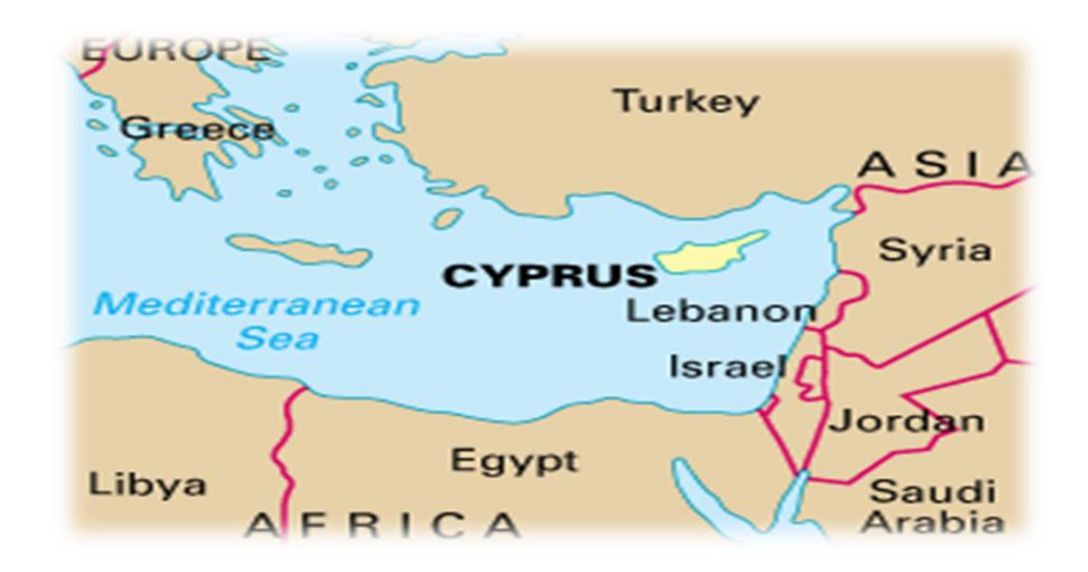
Map-5: Geography of Cyprus