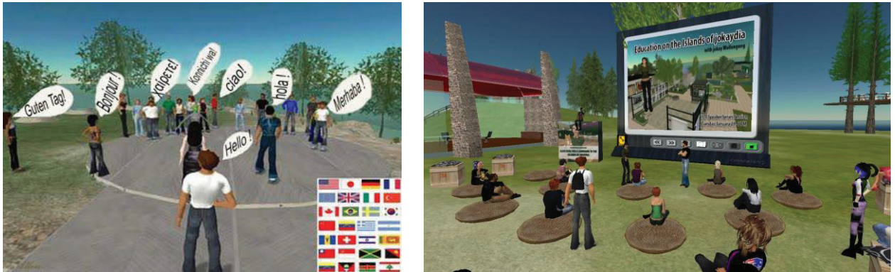
Figure 3. Scenes from Second Life

learners find the opportunity both to improve their FL writing skills and to exchange information with others about the things they read in the texts.