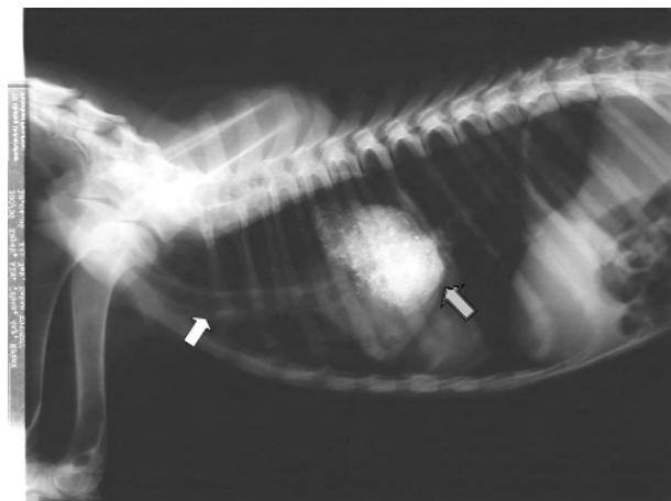
Figure 1. Survey radiograph showing the widened thoracic esophagus (white arrow) and radiocontrast food accumulation at the thoracic inlet (gray arrow).

To date, there have been limited data on the congenital vascular anomalies observed in small animal