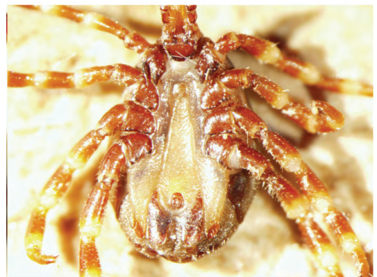
Figure 2. Male ventral area.