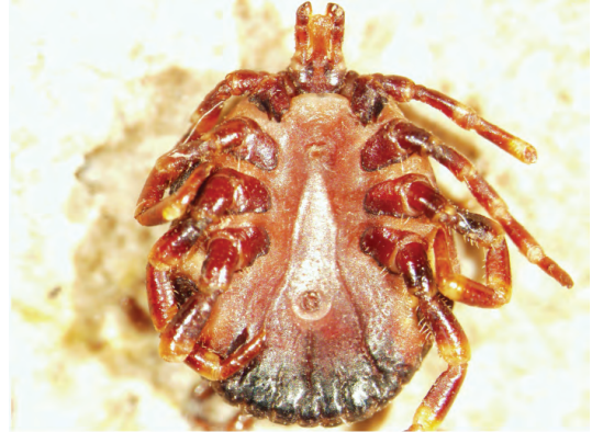
Figure 4. Female ventral area.