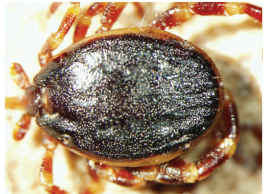
Figure 1. Male dorsal area.

Among the 19,679 adult ticks, 70.89% (13,951/19,679) were identified as Hyalomma spp. Five species were identified within this genus: Hyalomma marginatum (37.39%) (Koch 1844), H. excavatum (18.89%) (Koch 1844), H. detritum (13.68%) (Schulze 1919), H. anatolicum (0.86%) (Koch 1844), and H. rufipes (0.07%) (Koch 1844). These findings demonstrate that H. rufipes is present in cattle in the West Aegean region of Turkey, although in very low numbers. Pictures of male and female H. rufipes ticks are given in Figures 1-6. As indicated in Figures 1 and 6, dimensions of male and female H. rufipes ticks are 3075 and 1880 µm and 3213 and 2181 µm, respectively. The conscutum