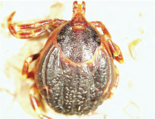
Figure 3. Female dorsal area.