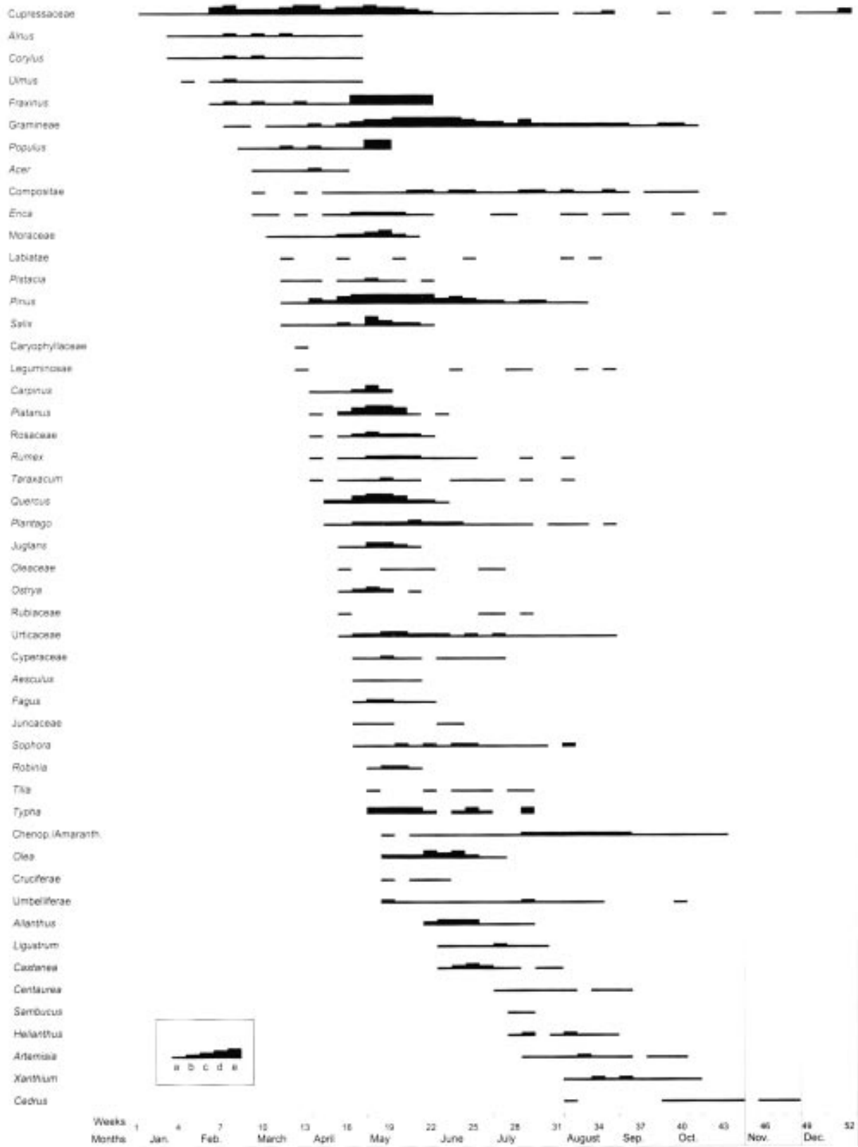
Figure 3. Pollen calendar of Balikesir. The heights of bars are proportional to pollen fall (grains/cm 2 ), as marked by letters: a: 1-9, b: 10-49, c: 50-99, d: 100-199, e: >200.