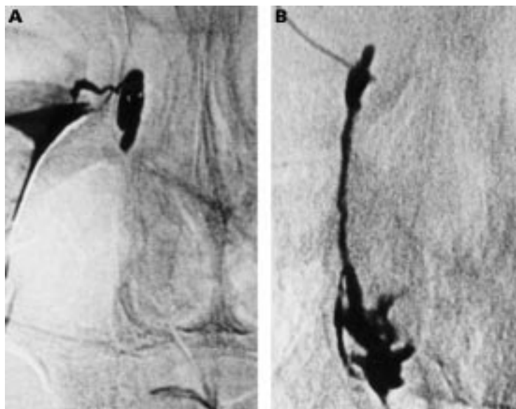
Figure 3 (A) Dacryocystogram shows the complete obstruction at the junction between lacrimal sac and nasolacrimal duct. (B) Dacryocystogram following balloon dacryocystoplasty reveals complete resolution of the obstruction site.