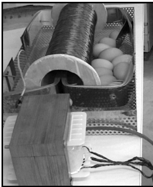
Figure 1. Image of EMF emitter set and exposed eggs used in present experiment that installed in bottom of incubator as EMF exposing site.

The EMF producer was designed for produce EMF with 50Hz frequency and 0.5 mT intensity with using urban electric line. An adaptor 220 v to 110 v (10 A) was used for minimizing of heat production by EMF emitter coin (Fig. 1). The EMF emitter set including bobbin (80 × 10 cm), wires and metal nucleuses was put in the bottom of hatchery machine in a metal lacuna (Fig. 1).