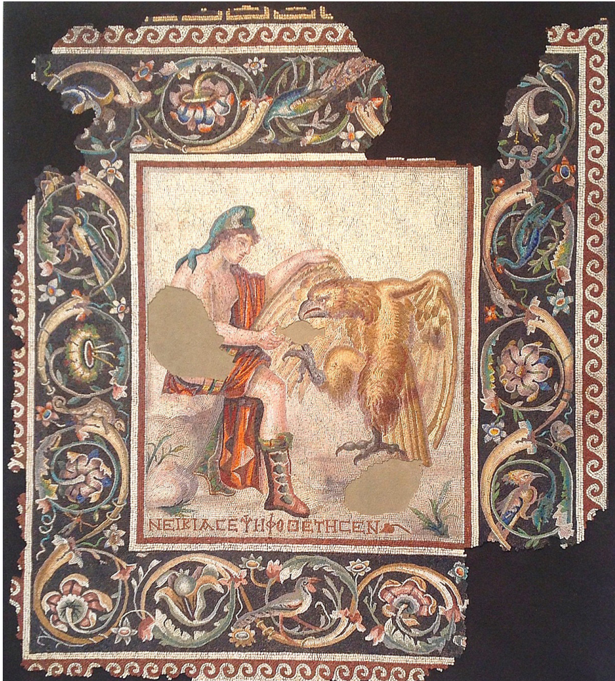
Figure 8 Ganymede mosaic. Metropolitan Museum of Art in New York.

reminiscent of documented representations in several Roman gems (Sichtermann 1988: nos. 154, 158, 165). At the bottom of the figurative field the inscription ΝΕΙΚΙΑΣΕΨΗΦΟΞΕΤΗΣΕΝ appears in reference to who made (Hurwit 2015: 22-23) or commissioned the mosaic (Fig. 8).