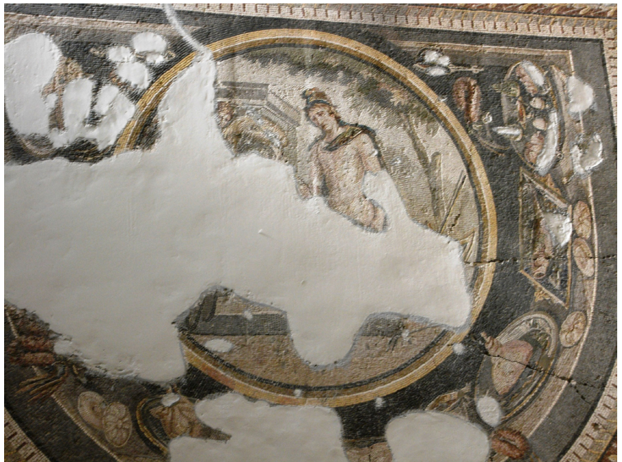
Figure 6 Mosaic of the House of Buffet Super. Antiocheia. Detail.

In this regard, another mosaic (Neira 2018: 21) from a private collection in Belgium, which is kept on loan in the Label Gallery, panel located in gallery 162 in the room dedicated to Roman sculpture in the Metropolitan Museum of Art in New York ( http://www.sedefscorner.com/2013/07/slow-art-day-at-met.html ), probably from the territories of the Roman provinces of the eastern Mediterranean, shows Ganymede, wearing a Phrygian cap and a mantle that leaves part of his body exposed, sitting on a rock, seen practically in profile, drinking from a container that holds the eagle in his right hand, which appears on his right, while posing his left hand on the wings of the bird, in a scene