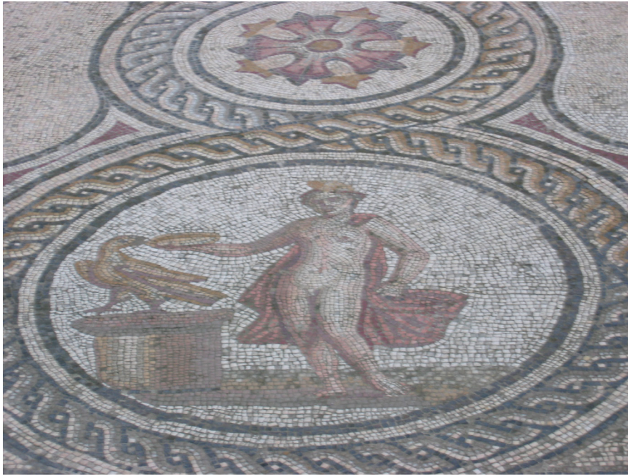
Figure 7 Ganymede detail. Mosaic from Italice .

reminiscent of documented representations in several Roman gems (Sichtermann 1988: nos. 154, 158, 165). At the bottom of the figurative field the inscription ΝΕΙΚΙΑΣΕΨΗΦΟΞΕΤΗΣΕΝ appears in reference to who made (Hurwit 2015: 22-23) or commissioned the mosaic (Fig. 8).