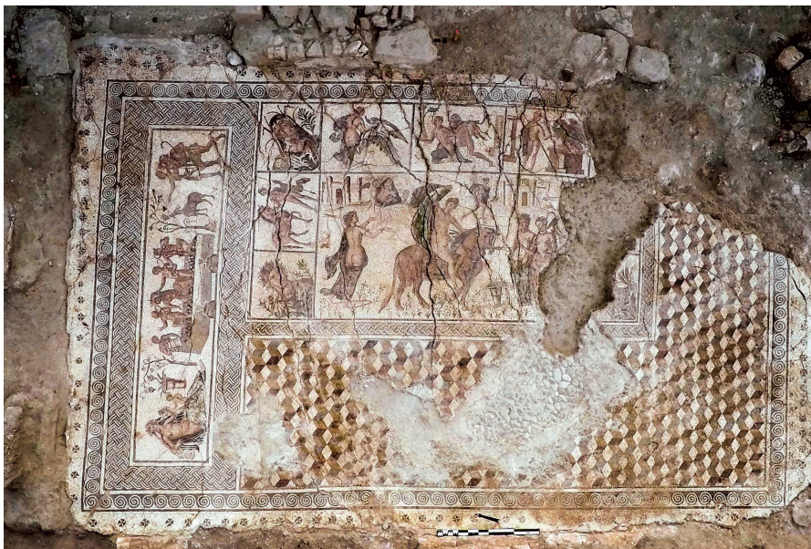
Figure 1 Mosaic of the Rape of Europe and the Loves of Zeus. Astigi (Écija).

We must note that the large mosaic of the Zeus’ Lovers (Fig. 1) shows an unusual composition formed by two inverted/opposed L’s. The surface of figured areas is slightly bigger than those of geometrical figures. This figured surface shows the above mentioned conjunction of Bacchic scenes with other mythological topics. A rectangular panel, disposed as a frieze, has a central scene reproducing satyrs performing the grape tread. In the left side of this scene we can recognize a female figure laying down close to a child, while in the right side we can see goat approaching a vine in front of two men that seem to be surprised. In a second figured area of this mosaic, we can recognize the representation of the rape of Europe and, in the pictures that acted as framework of three sides of this