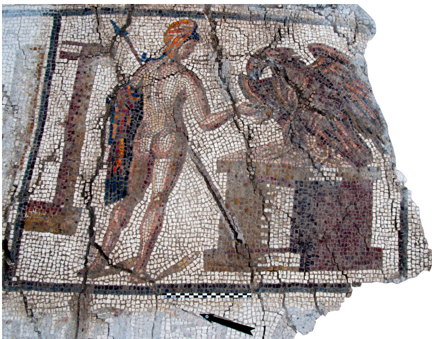
Figure 5 Ganymede detail in the astigitanus mosaic.

Similarly, the representation of the Ganymede legend in this astigitanus mosaic is rare (Fig. 5). The young man appears, standing, on his back, with a mantle that falls down his left side, practically naked, with the characteristic Phrygian cap, a large pedum and a recipient, possibly a patera , giving the eagle a drink, which appears above a pedestal, an ara , exercising, once consummated the rapture, as cupbearer of the god in the Olympus, as the literary sources recount (Sichtermann 1988: 154-169). However, it is necessary to point out that it is the least common image in the Roman mosaics, where the legend of Ganymede acquired a great success, mostly capturing the approach of the god turned into