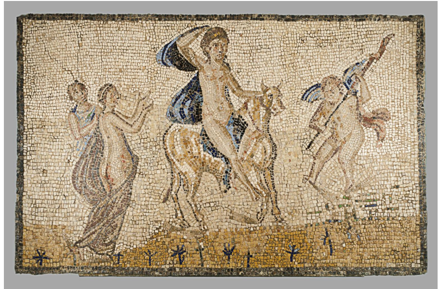
Figure 3 Mosaic from Fernán Nuñez (Córdoba).

However, it is noteworthy that, although the female figure located on the left of Europe in both the Astigi mosaic and that of Fernán Nuñez responds to the reproduction of the same model, the restoration of the pavement and the recently published study of García-Dils de la Vega and Ordoñez (2019) reflects that this figure is actually in the astigitanus mosaic not one of the servants who accompanied Europe, but a representation of Danae (Fig. 4), when /she appears, with the hands extended forward, receiving the golden rain, simulated through vertical strokes, well noticeable after the restoration (García-Dils de la Vega - Ordoñez 2019: 27-28 figs. 27-28), which fall from the image of the mature and bearded bust covered by a mantle, undoubtedly, Zeus, who in the upper area of the rectangular field, wherein the background two groups of buildings rise, figure to the left of it next to the presence to novelty of an eros .