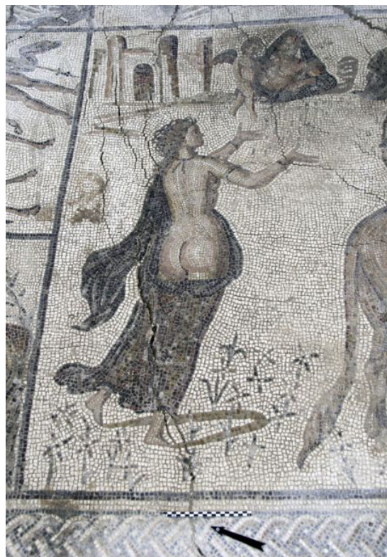
Figure 4 Detail of Danae in the astigitanus mosaic.

However, it is noteworthy that, although the female figure located on the left of Europe in both the Astigi mosaic and that of Fernán Nuñez responds to the reproduction of the same model, the restoration of the pavement and the recently published study of García-Dils de la Vega and Ordoñez (2019) reflects that this figure is actually in the astigitanus mosaic not one of the servants who accompanied Europe, but a representation of Danae (Fig. 4), when /she appears, with the hands extended forward, receiving the golden rain, simulated through vertical strokes, well noticeable after the restoration (García-Dils de la Vega - Ordoñez 2019: 27-28 figs. 27-28), which fall from the image of the mature and bearded bust covered by a mantle, undoubtedly, Zeus, who in the upper area of the rectangular field, wherein the background two groups of buildings rise, figure to the left of it next to the presence to novelty of an eros .