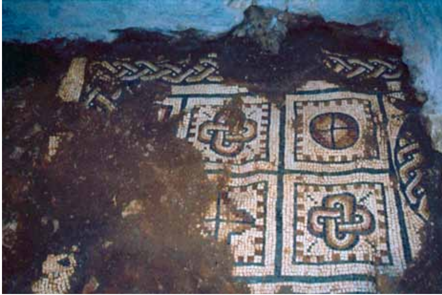
Figure 15 Mosaic fragment that decorated the apse of one of the two spaces that frame the triclinium.