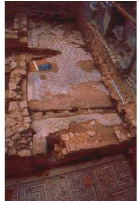
Figure 3 Mosaic of the east portico of the peristyle.