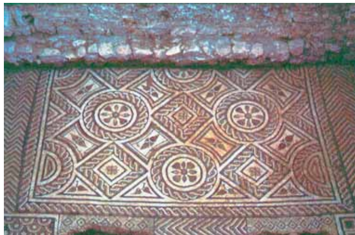
Figure 11 Mosaic of a cubiculum.

In the southwest and southeast corners of the compartment are two carpets. The first larger, whose field comes decorated with scales. In the other, the field is decorated by an orthogonal composition of squares and concentric rectangles. They are still visible bands of the east side and the west side of mosaic. Both with a composition of rainbow in broken lines.