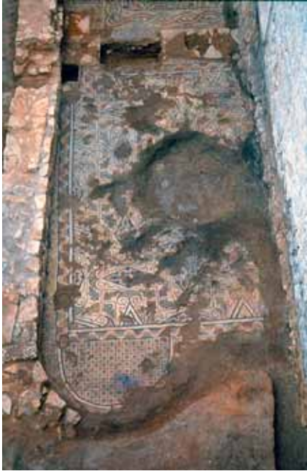
Figure 13 Mosaic of the south area of the space that should have had a social function, as reception room of the Roman building.