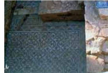
Figure 6 The long corridor mosaic and mosaic of the small corridor.