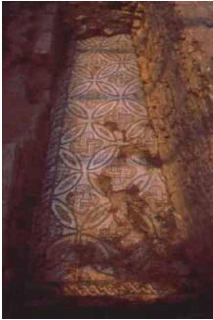
Figure 8 Mosaic of a space thermal sector.