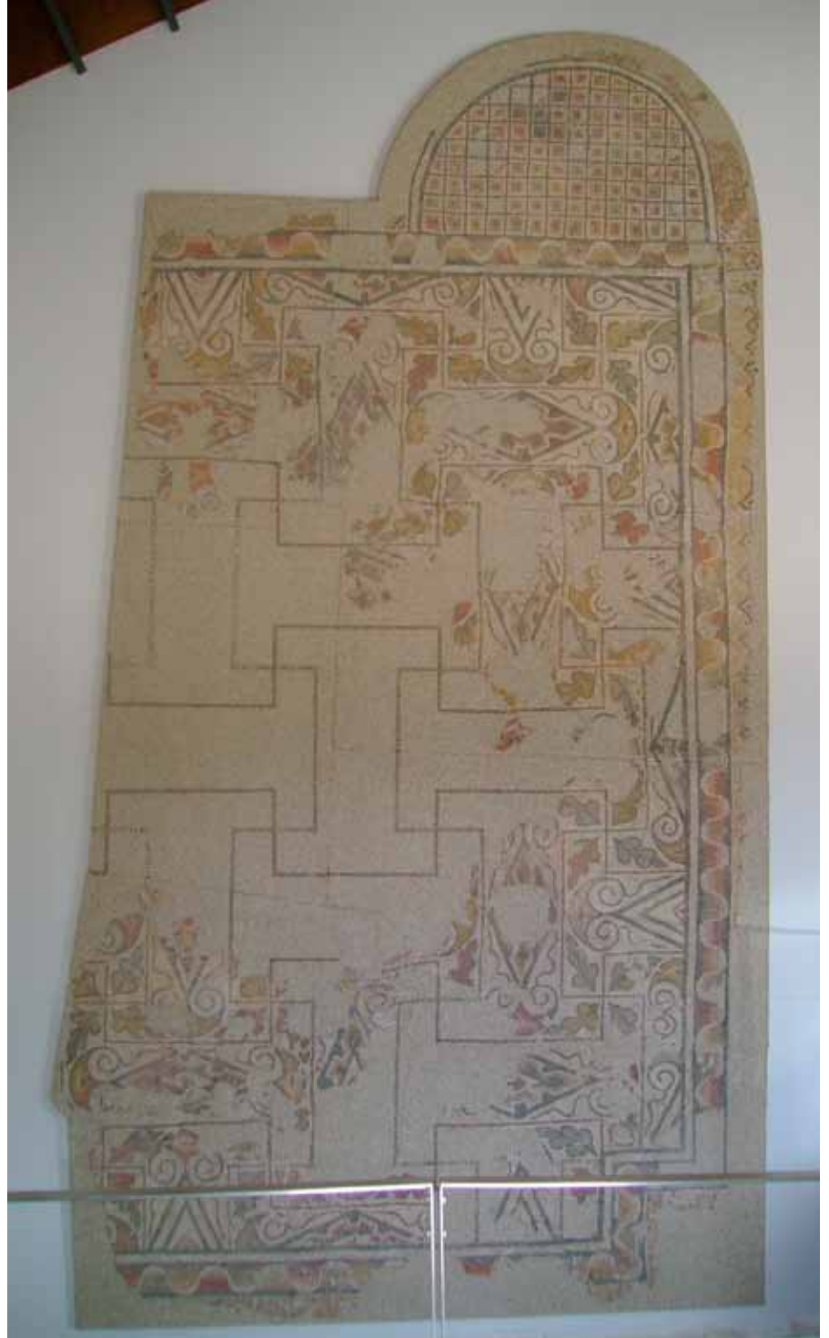
Figure 14 Mosaic exposed as panel at one of the walls of the space where he currently works the reception of visitors of the Monumental Complex of Santiago of Guarda.

The band of the mosaic is decorated by a colour match, being inscribed along the western edge of the mosaic one lozenges alignment.