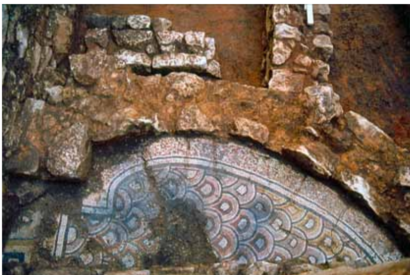
Figure 10 Mosaic of the apse of the support room to triclinium.