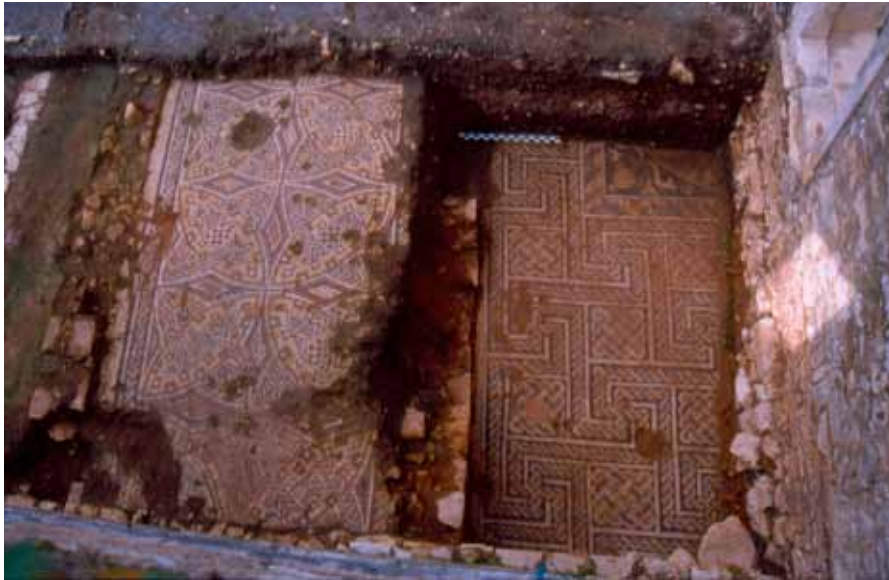
Figure 2 Mosaic of the north portico of the peristyle (at left); Mosaic of the long corridor (at right).