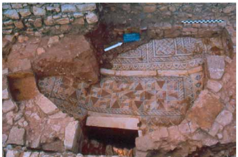
Figure 5 Mosaic of the apse of the long corridor.

To separate the apse area from the remaining corridor area, lying on the floor an alignment limestone slabs. It follows to the west a line of oblong scales and meander swastikas formed from braiding two strands, whose intervals are filled by plaited (Figs. 2, 3, 5). Midway through the corridor the pattern of the pavement