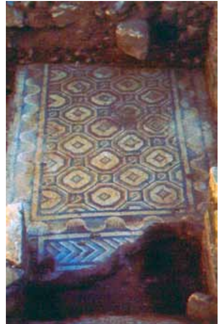
Figure 9 Mosaic of the small corridor.