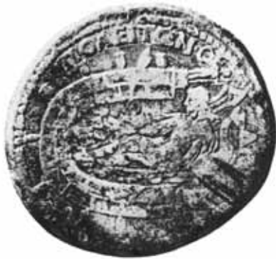
Figure 4 Boyce, 1958, Fig. 10/1 Harbour Illustration on a coin from the Antoninus Pius period of Pompeiopolis

were first taken to the frontal staired area of the colonnade that was painted in black in the mosaic. From there, they were carried to the agora by the river. Farther on, a man is seen walking to the left of the U-shaped building, carrying a basket in his outstretched right hand and a package under his left arm. Even though it is not really possible to make a precise point, the presence of this man can be evaluated as if he is carrying goods unloaded from the port. This colonnaded part and the black stairs behind it must have been designed to offer the public a recreation area where they could relax and enjoy the breeze 2 .