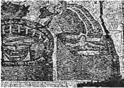
Figure 3 Levi, 1947, Fig. LXXIX/a The mosaic of the Yakto villa, topographical border, U-shaped structure and water reservoir