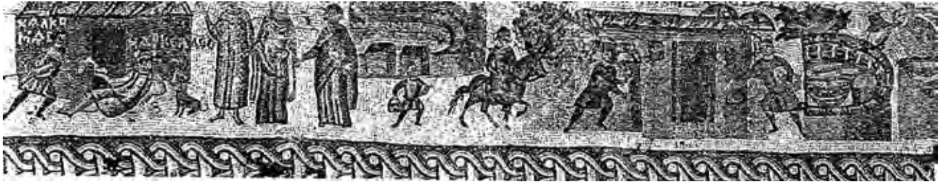
Figure 1 Levi, 1947, Fig. LXXIX/a The mosaic of Yakto villa, topographical border

he also ordered a reservoir to be constructed by the water source on the mountain (Chowen 1956: 277). As mentioned above, Levi suggested that the building on the depiction could be a storage area from where the water coming from Daphne's Kastalia and Pallas sources was to be distributed (Levi 1947: 326). However, to the right of the U-shaped structure, there is another formation illustrated in the mosaic that might be a water reservoir. Furthermore, water flowing into this second structure is clearly indicated with two separate white lines which symbolize the Pallas and Kastalia sources whose names are inscribed in the upper part of the mosaic border (Fig. 3). Within this context, the reservoir which Malalas referred to as storing water coming from sources of Daphne must be this second building located to the right of the U-shaped structure on the mosaic.